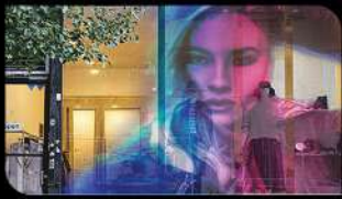
RETAIL & HOSPITALITY