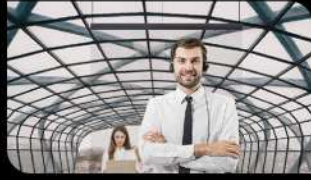
TRANSPORTATION & AIRPORT