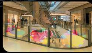
SHOWROOMS & TRADE SHOWS